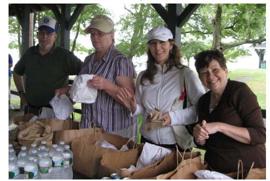
New England District of Kiwanis Annual Convention Aug 18-21, 2011